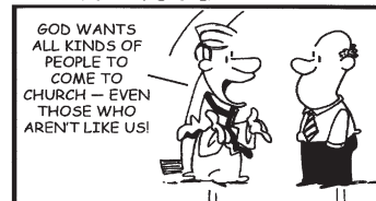
6TH SUNDAY OF EASTER